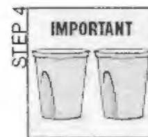
STEP 4 IMPORTANT You must drink two (2) more 16-ounce containers of water over the next 1 hour.

DO NOT drink any liquids three (3) hours prior to your procedure. (No water)