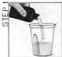
STEP 1 Pour ONE (1) 6-ounce bottle of SUPREP liquid into the mixing container.