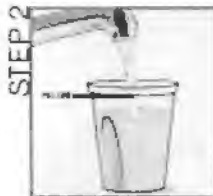
STEP 2 Add cool drinking water to the 16-ounce line on the container and mix.